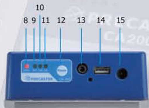
Sensor(Slaver) Bluetooth Leveler